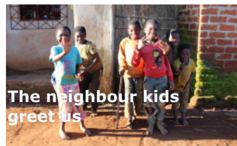
The neighbour kids greet us

mostly former students we know from the different schools - WOW! Luke 10:1-2 says we should ask the Lord of the harvest for more workers. And we did. God answers and sends people. Now it is up to us to get to know this group of people, welcome them and integrate them into Youth With A Mission Niassa. Probably not everyone will become staff but we hope for a nice group of people that we can work with and invest in.