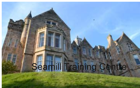
Seamill Training Centre

A newsletter, all the way from Holland this time! We just got back from Scotland and are starting our proper furlough: we'll be in the Netherlands until mid-November. In Scotland we participated in a six-week course: LDC = Leadership Development Course . This is a course for missionaries in leadership position with a minimum of 5 years on the mission field. We felt the need for a serious 'overhaul' and some fresh input into our lives.