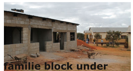
familie block under construction, classroom in the background

The connection of our house has been extended and since a week everything is functioning. It is soooooo easy to just push a button and have light.