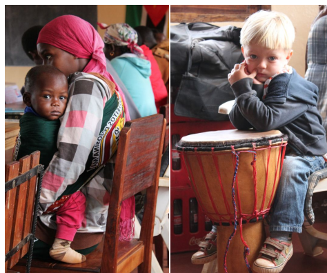
in the classroom

Many students come straight out of Islam and now that they understand who Jesus is, they have decided to follow Him. We see students changing their behavior daily; men start helping there wives, people learn to resolve conflicts and they ask for forgiveness. Last week was awesome: many confessed their sin in class. Often this deals with idolatry/ancestry worship but there were just as many people confessing adultery. It was a special and a delicate moment to hear men confess and ask forgiveness and then have their wives in their turn express their pain and forgiveness towards them.